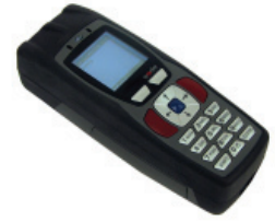
CR3500 Hand Format

Enabled for both in-stand and out-of-stand operation the CR3500 can be used as a wireless hand-held and fixed presentation reader. This lightweight, comfortable and easy to use bar code reader solution can be further accessorized to fit the needs of applications in the healthcare, public safety, manufacturing, aerospace, industrial automotive and defense environment. With its modular design and JavaScript platform, the CR3500 is future-proof and the most cost-effective reader available.