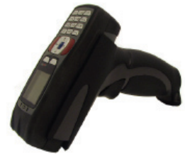
CR3500 Battery Handle Format