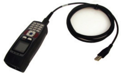
CR3500 Cabled Format